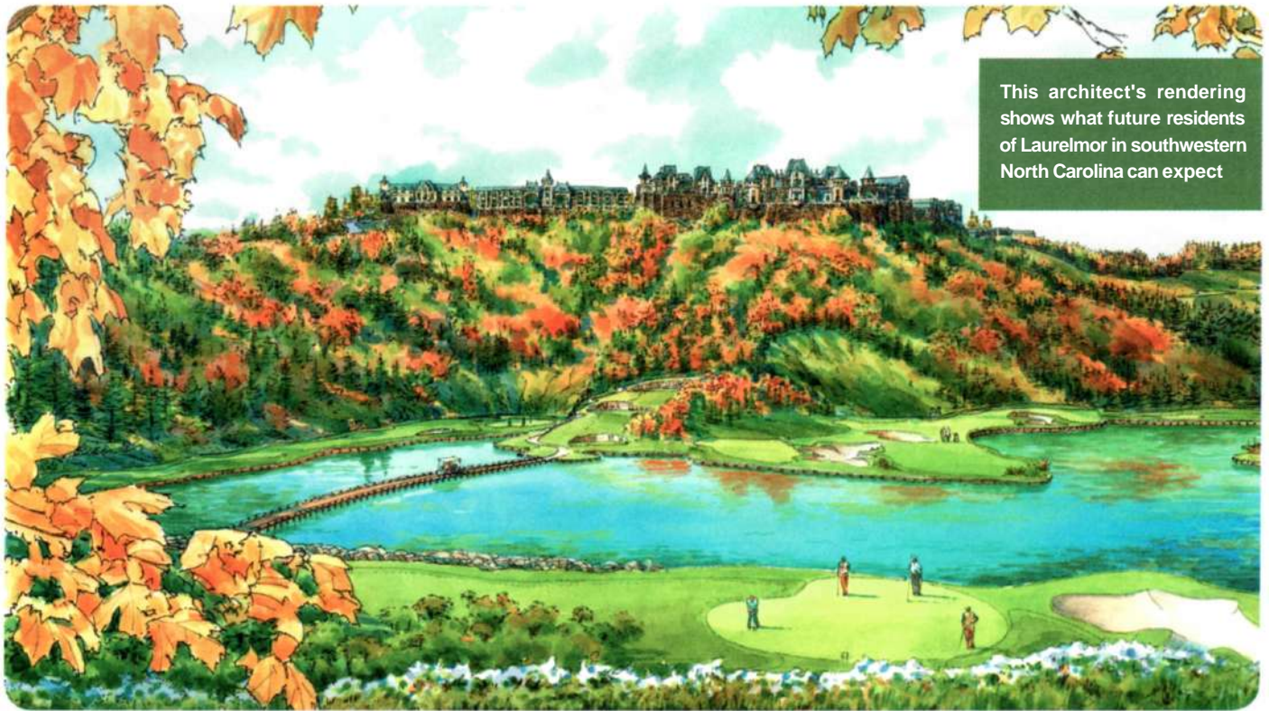
This architect's rendering shows what future residents of Laurelmor in southwestern North Carolina can expect