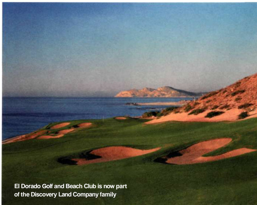
El Dorado Golf and Beach Club is now part of the Discovery Land Company family